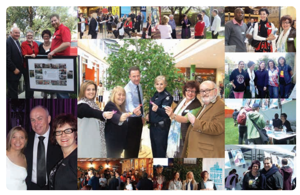
Collage of Community Development in Melton

This meant building relationships with local people and local organisations and then through these relationships gaining an understanding of Melton and its community. In real estate the buzz words are 'location, location, location', but in community development it might be, 'relationships, relationships'.