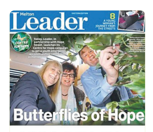
Leader Joins Hope Street Youth and Family Services in campaign for a youth emergency accommodation centre